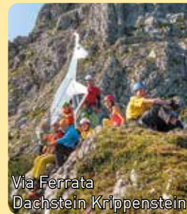
Via Ferrata Dachstein Krippenstein