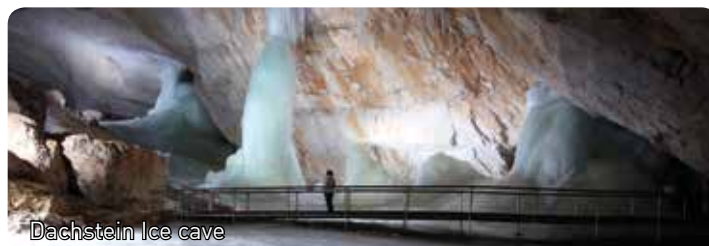
Dachstein Ice cave